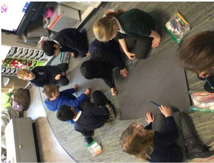
Designing and drawing our display window for the winter windows.