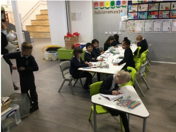
Drawing Luna the cat from our book 'look up'.

And lastly, it's beginning to feel a lot like Christmas: