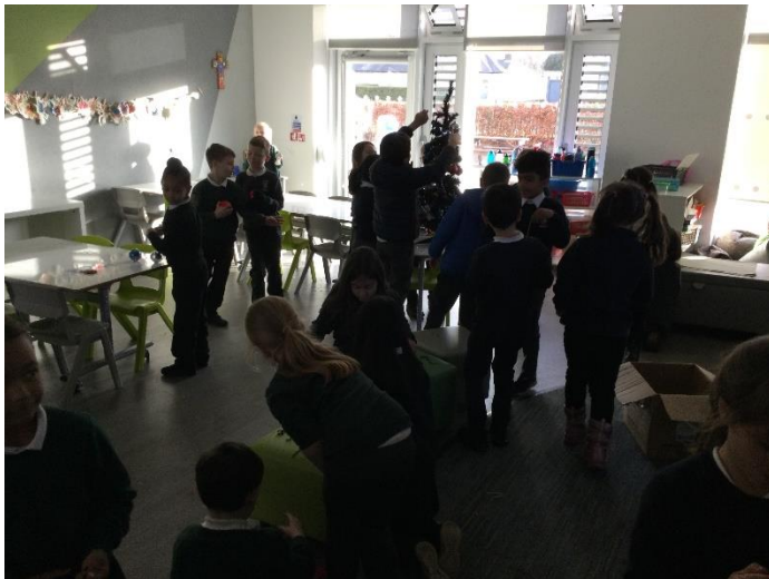
Decorating our class Christmas tree. Everybody was super excited.

And lastly, it's beginning to feel a lot like Christmas: