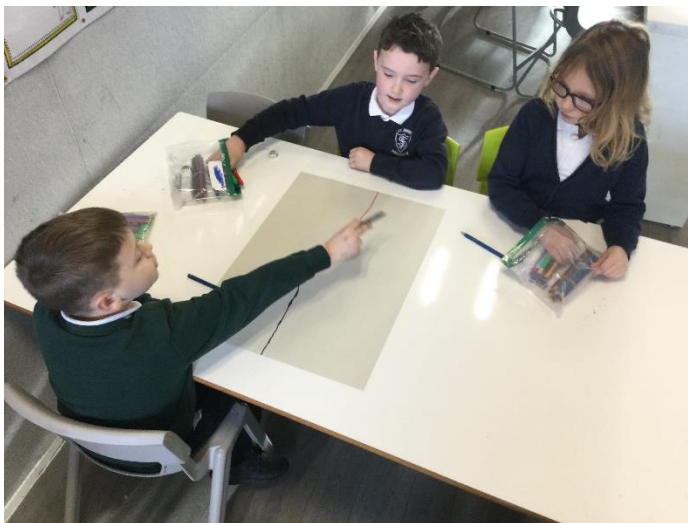
Working in groups to research the pros and cons of having a mobile phone inspired by our book 'look up'.