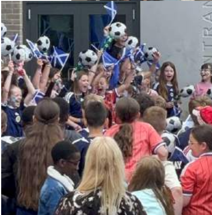
Sneak Peak of our World Cup Fun Day